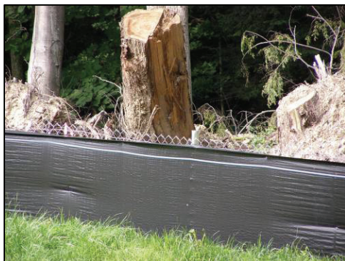
Siltation fences are used to control the loss of soil from a construction site. This particular siltation fence is termed a "super siltation fence" and is located at an AMD remediation project within the Bennett Branch subwatershed

Erosion is common along streambanks, steep slopes, and ridgetops. Streambank erosion occurs when the land adjacent to the waterway erodes and deposits sediment into the waterway. Typically, erosion is accelerated by improper land uses and a lack of vegetation along the streambank. Vegetation anchors soil in place, preventing it from washing away during high stream levels or heavy rains. However, if the vegetation is removed or inadequate, the soil is easily washed into the waterbody. A lack of vegetation also leaves soils vulnerable to high winds, which can induce erosion.