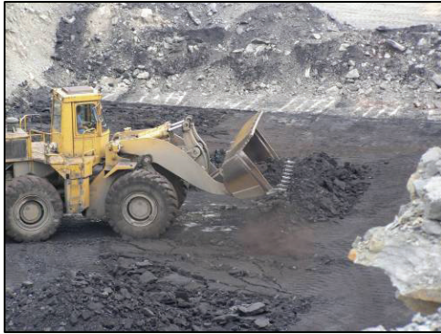
An active mining site within the Bennett Branch subwatershed

The southwestern portion of the watershed, particularly the Bennett Branch subwatershed, has a long history of coal mining, which continues today. The majority of the mining activities are concentrated in the Bennett Branch subwatershed due to the geological makeup of the region. Sterling Run, a subwatershed of Driftwood Branch Sinnemahoning Creek, has also experienced significant mining activities. Figure 2-4. identifies active and abandoned mining activities and active reclamation projects.