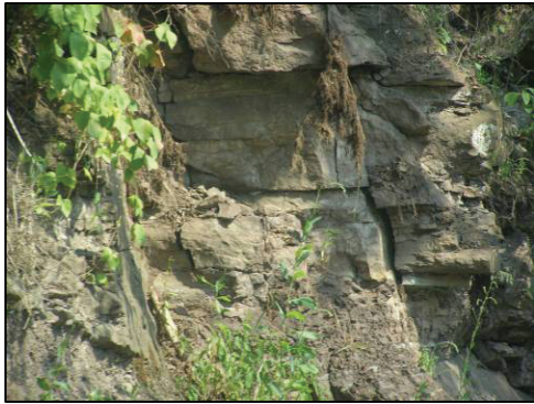
Outcrop of rocks along Route 120

The bedrock geology is from the Devonian, Pennsylvanian, and Mississippian periods that occurred during the Paleozoic Era approximately 290 to 405 million years ago. The Devonian period is named for the County of Devonian in southwest England where Devonian outcrops are common. The Devonian period occurred 365 to 405 million years ago. Red sandstone, gray shale, black shale, limestone, and chert are associated rock types (Devonian, 2007).