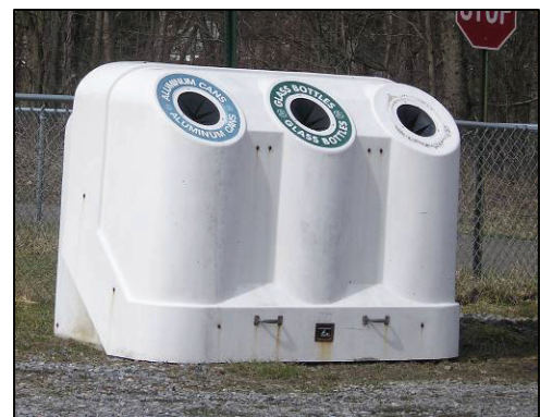
Recycling receptacles located at Thunder Mountain Park in Benzette

Recycling starts with community collection of approved materials, which generally includes glass, plastic, paper, and metal materials. Community collection may be done through curbside collection, drop-off centers, buy-back centers, and/or