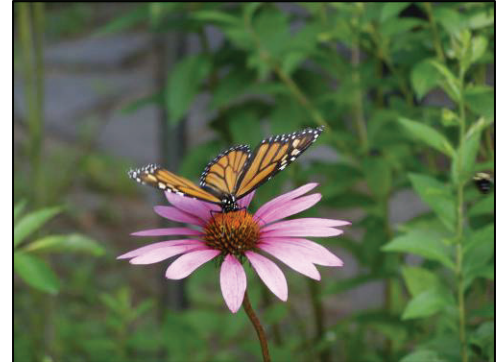
Butterflies, like this Monarch butterfly, rely on the presence of flowers to survive

Wetlands are “areas that are inundated or saturated by surface or ground water at a frequency and duration sufficient to support, and that under normal circumstances do support, a prevalence of vegetation typically adapted for life in saturated soil conditions” (U.S Army Corps of Engineers, 2002). Wetlands are delineated according to hydrology, soil type, and vegetation. Whether constructed or naturally occurring, wetlands have a variety of appearances. Standing water, inundated soils, or an apparently dry field can be a wetland.