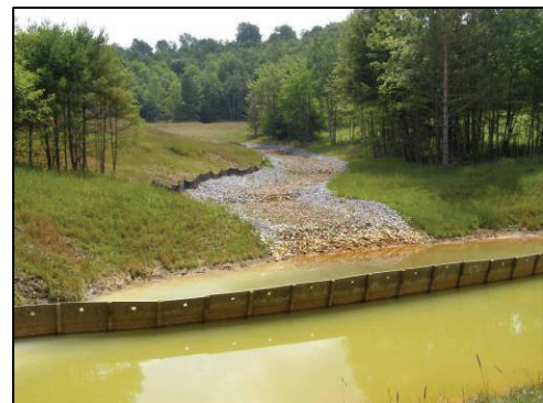
This settlement pond is one of many passive abandoned mine drainage treatment systems within the Bennett Branch subwatershed

Pennsylvania Bureau of Abandoned Mine Reclamation (BAMR), a division of DEP, is working to remediate hazards and impacts of abandoned mine drainage in the Bennett Branch subwatershed. BAMR has invested more than $11.5 million towards remediation and restoration of local abandoned mine lands. Table 2-4 identifies abandoned mine land reclamation efforts occurring in the Bennett Branch subwatershed as of 2007.