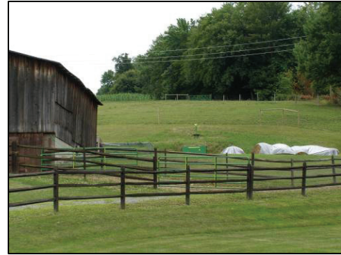
Farm along West Creek

Agricultural lands are under increasing pressure to convert to residential or commercial developments and other land uses. According to USDA's Natural Resources Inventory conducted between 1992 and 1997, more than 11 million rural acres in the country were converted to a developed use and over half of that acreage was agricultural land. That conversion translates into a loss of over one million acres of agricultural lands each year, or more than 3,250 acres every day (USDA, 2000).