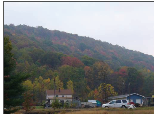
Mountainous terrain typical within Sinnemahoning Creek watershed

Geology is the science that deals with the study of the earth, its history, and its natural processes and products. Geology may also refer to the names and descriptions given to natural features on our planet. Geological investigations of an area can yield insight to the land's history, composition, structure, and natural resources.