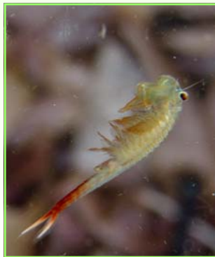
Springtime Fairy Shrimp

Three species of mole salamanders encountered in seasonal pools are the marbled salamander, the spotted salamander, and the Jefferson salamander. They are all considered indicator species. Other seasonal pool indicators are the wood frog and the eastern spadefoot (a burrowing frog).