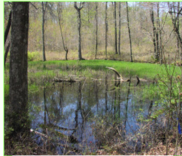
Seasonal pool in the spring, Centre County

The Pennsylvania Seasonal Pools Registry is a citizen-based effort to document locations of temporary or seasonal wetlands and the species associated with them.