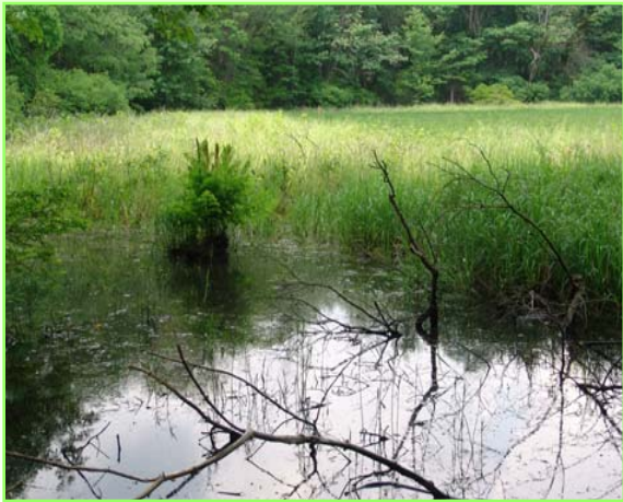
Seasonal pool, Franklin County

They are filled each spring by rain and snow melt, then dry up for a period of time during the summer. The dry phase of a seasonal pool is important because it prevents year-round water dependent animals such as fish from living in these pools. Fish, when present, pose a threat because they are predators on the eggs and larvae of other aquatic species.