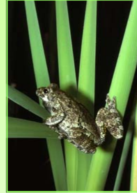
Gray Tree Frog

Do you listen for the soft hoots of tundra swans heading north, or the noisy chirps of spring peepers? These are some of the signs that a seasonal pool near you is coming to life.